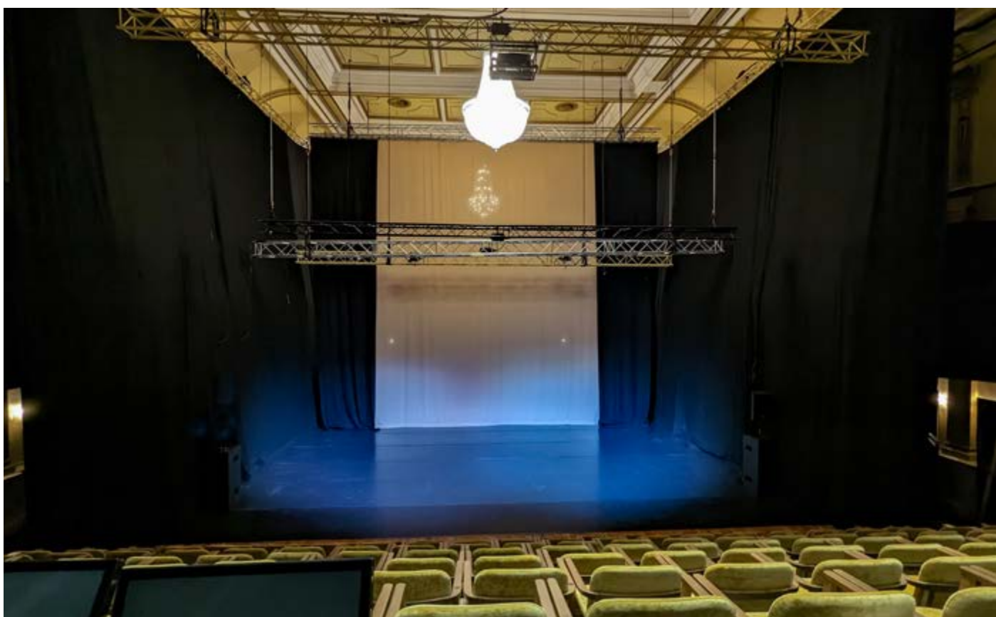
Muzenzaal • Theateropstelling