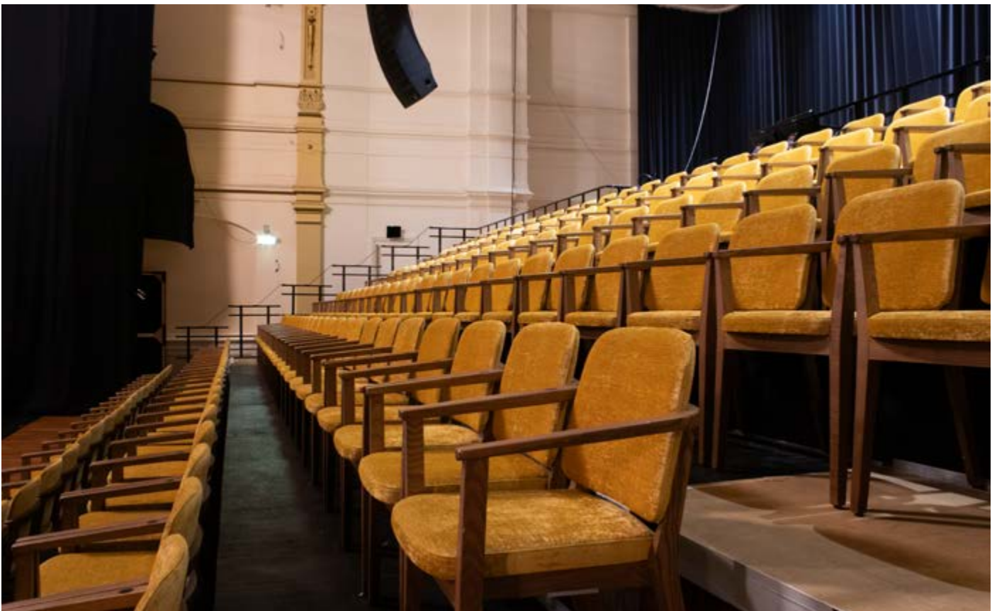
Muzenzaal • Chairs on stalls in Theatre setting