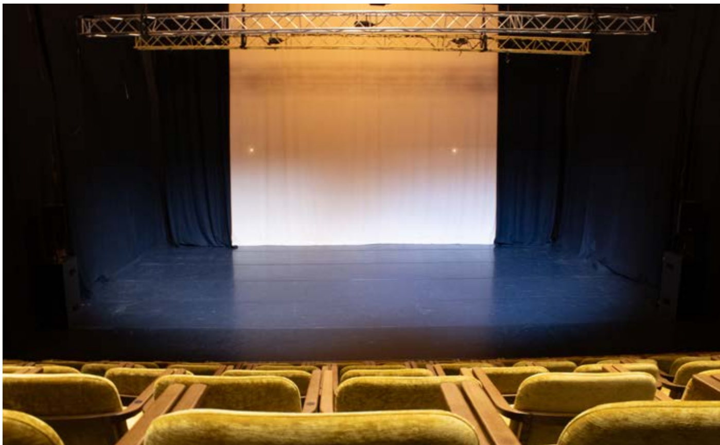
Muzenzaal • Theateropstelling