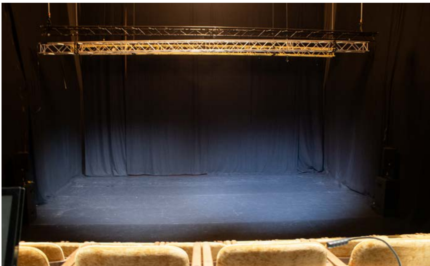
Muzenzaal • Theateropstelling