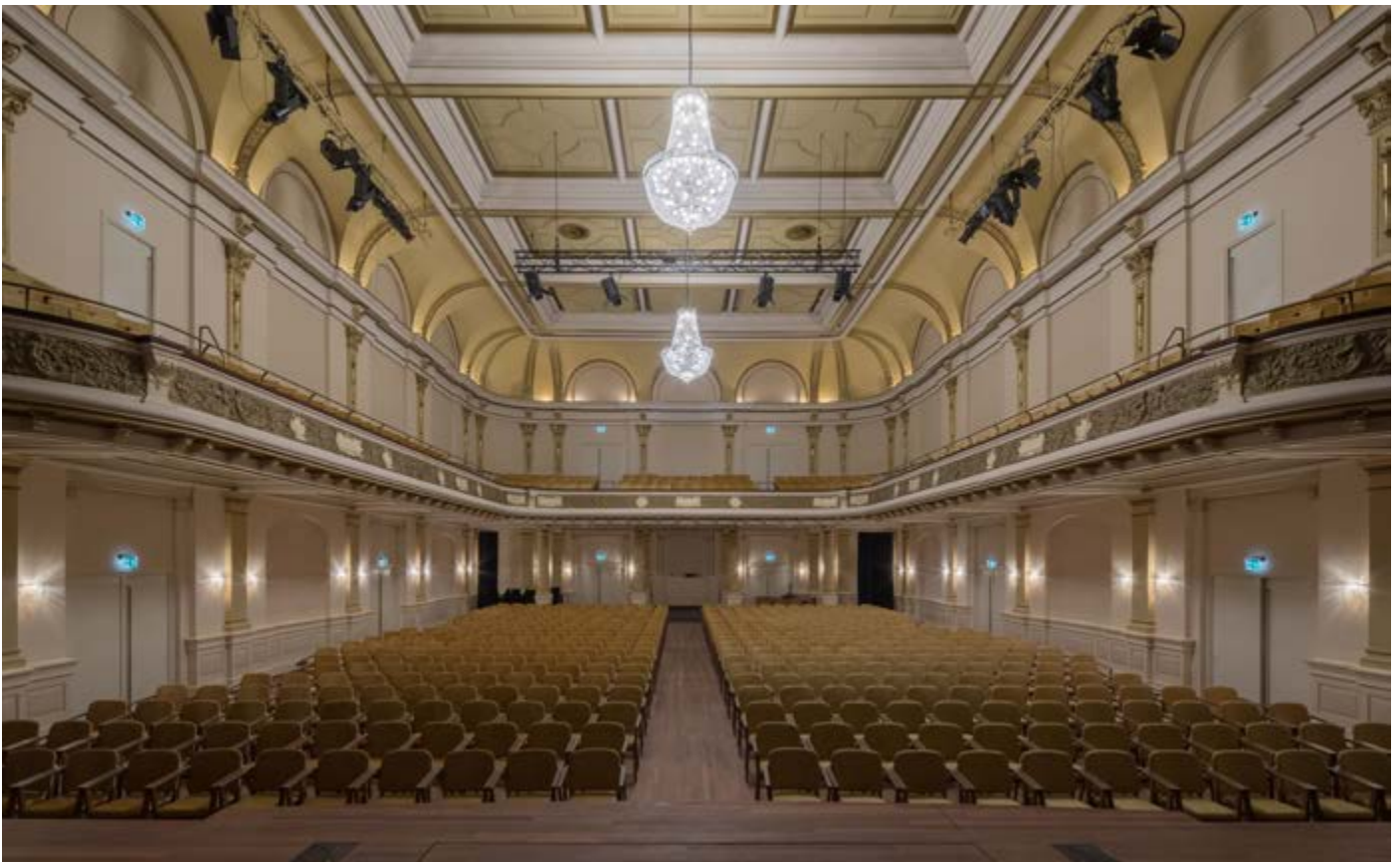
Muzenzaal seated - normal setting