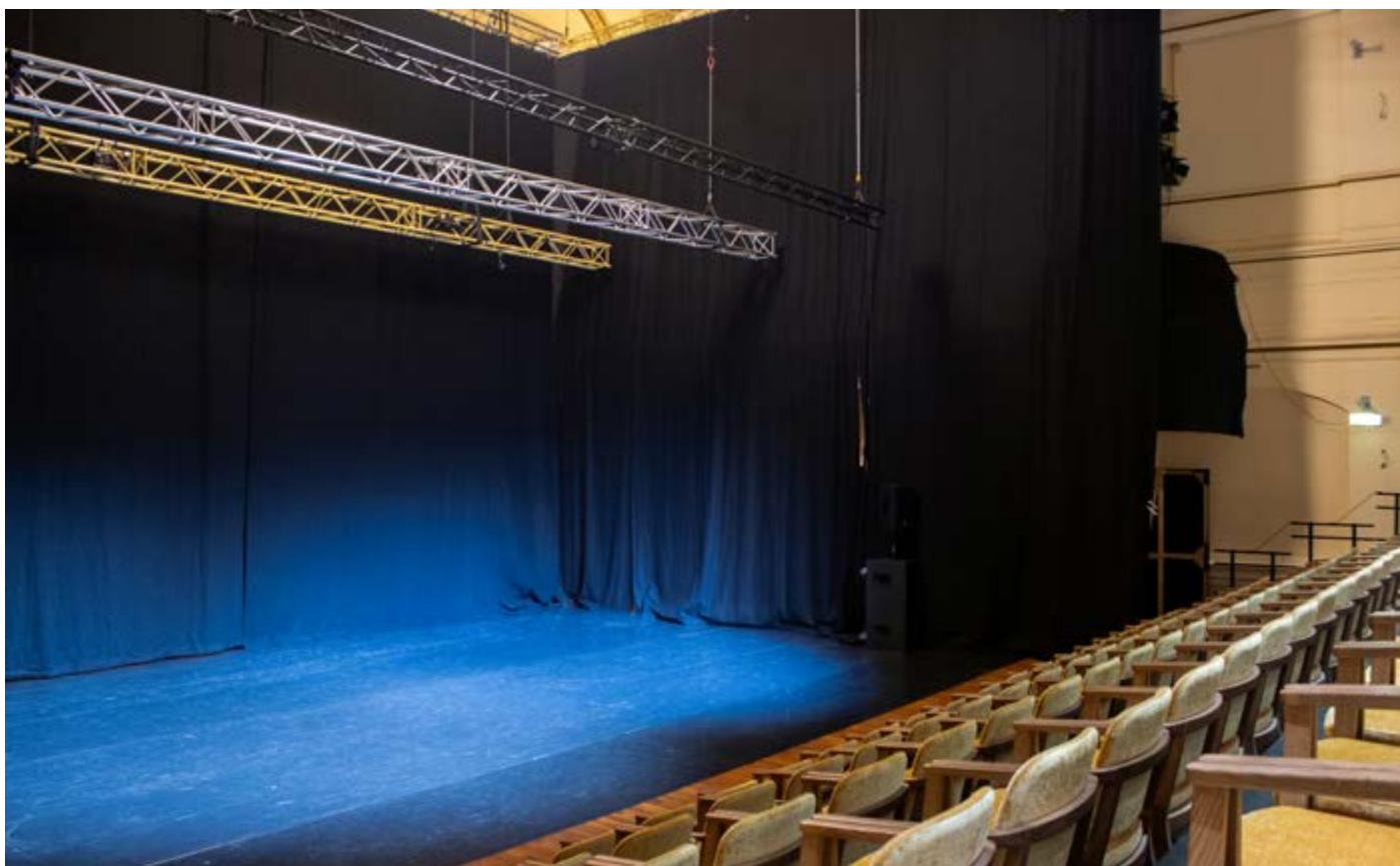
Muzenzaal • Theateropstelling