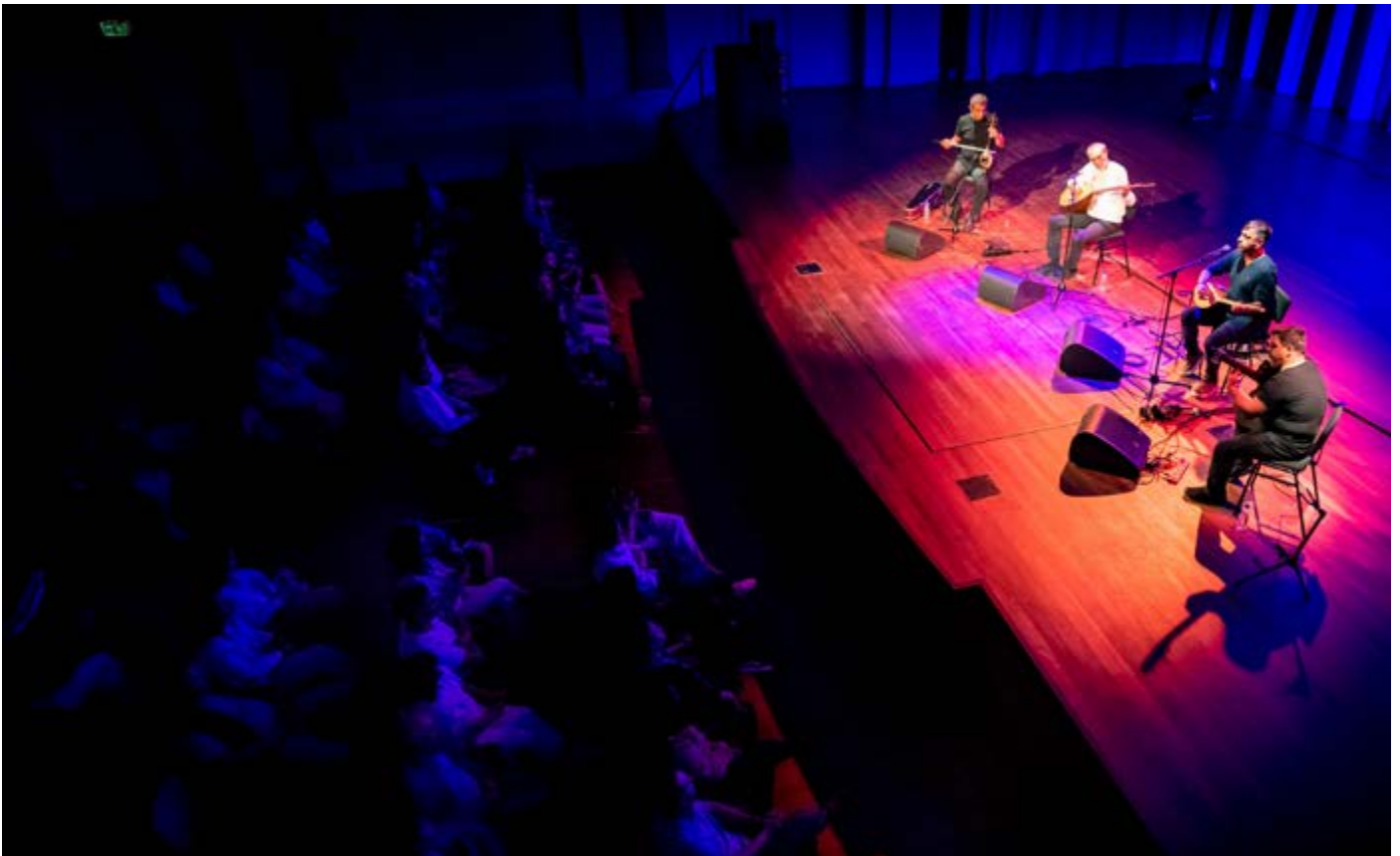
Muzenzaal Cengiz Oskan