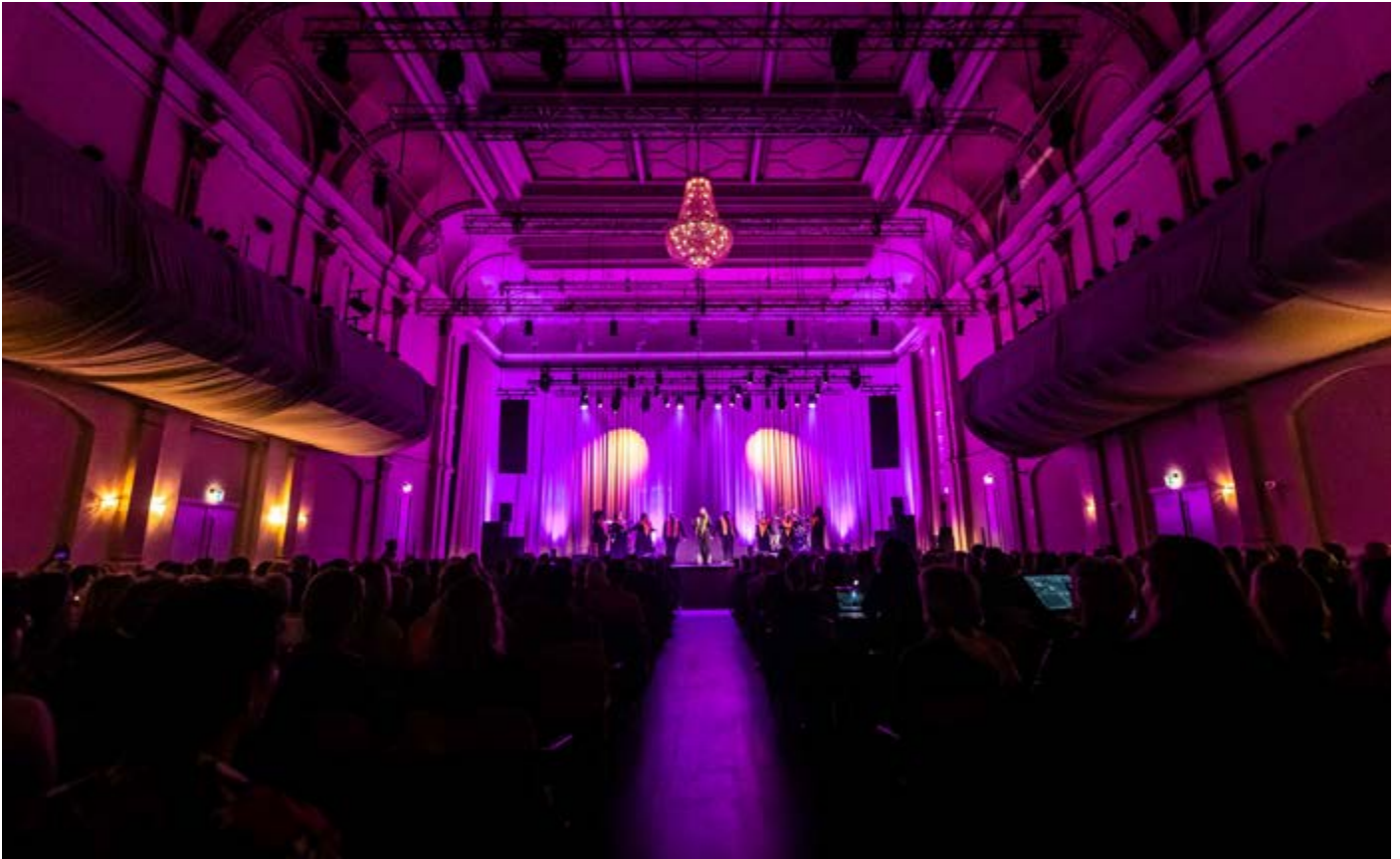
Muzenzaal Harlem Gospel Choir