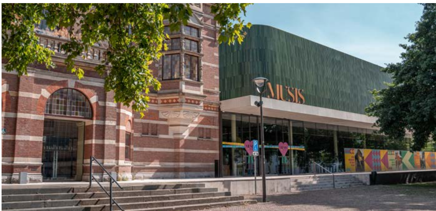
Main entrance