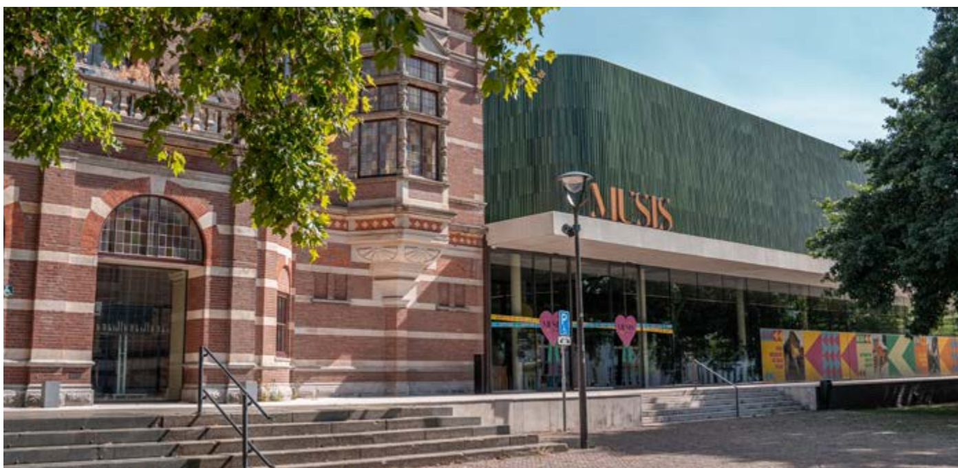
Main entrance